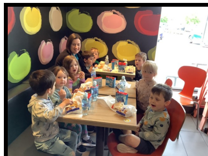
A trip to McDonald's