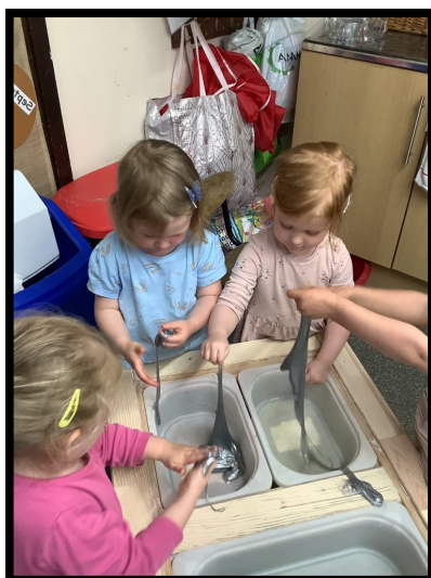
Exploring the glittery Slime.