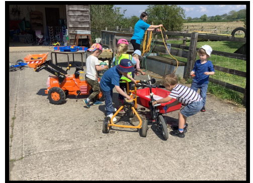
Giving the vehicles a wash.