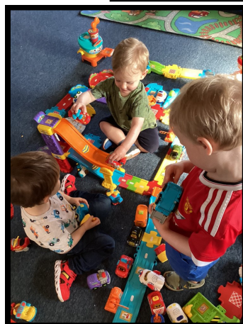
The Toot Toot set is amazing!