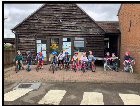
Having so much fun riding our bikes