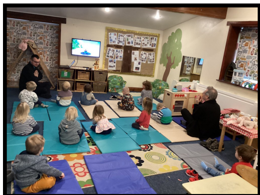
Enjoying a Yoga session