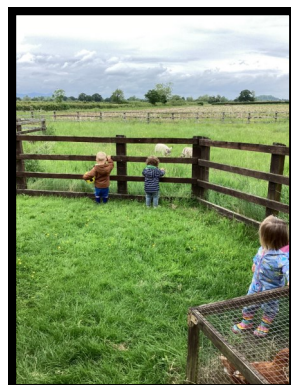
Watching the Nursery lambs.