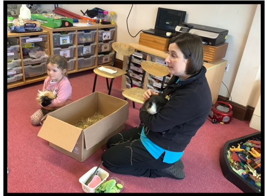
Guinea pigs, Peppa and Caramel came to visit us.