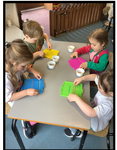
Completing the Funky Fingers activity.