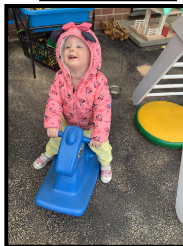
Having fun in the garden.