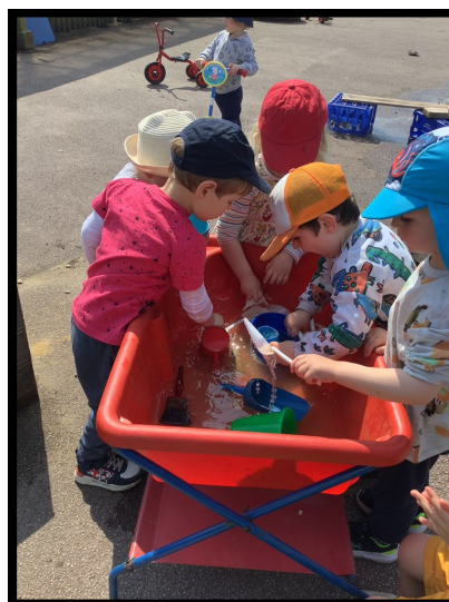
Water tray fun.