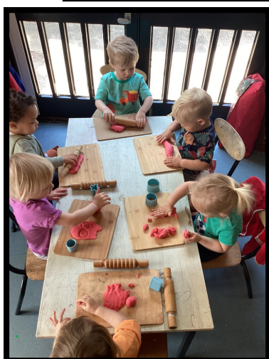
Rolling and cutting the play dough