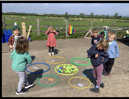
Completing a counting game in the sunshine.