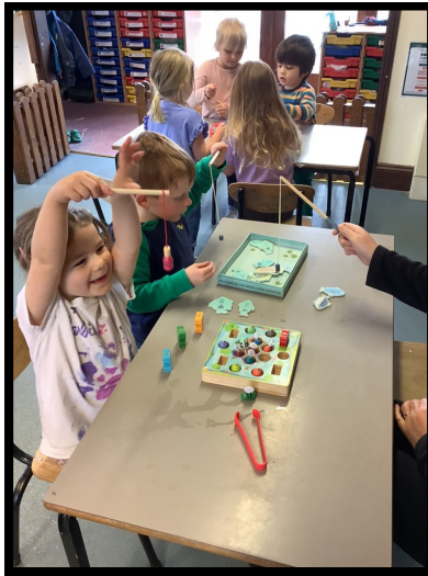
Enjoying playing the fishing game.