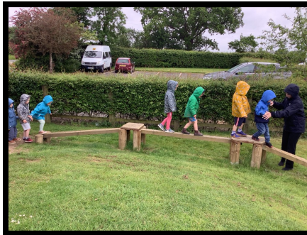
Practising our balancing.