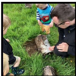
Looking for bugs.