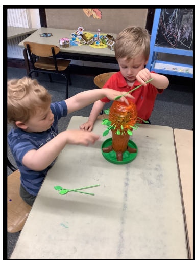
Playing games together