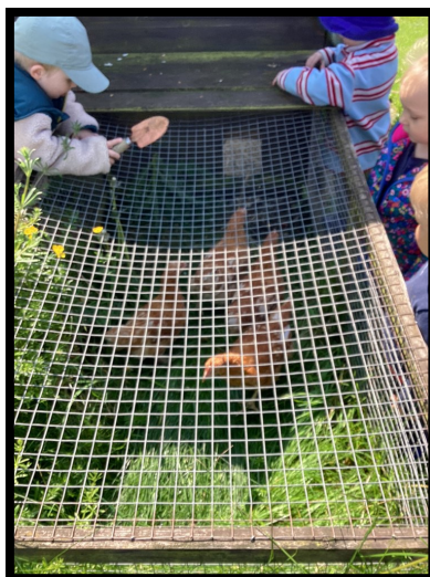
Checking on the Nursery chickens.