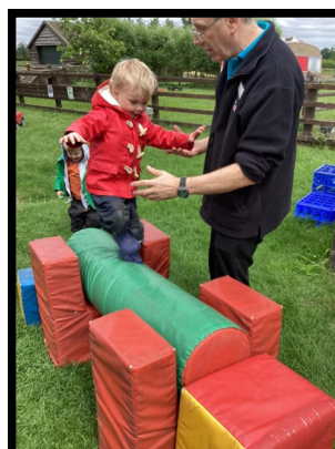
Practising our balancing.