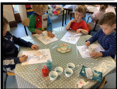
Creating our Frozen pictures.