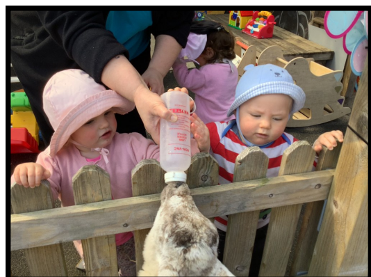
Helping to feed the lambs.