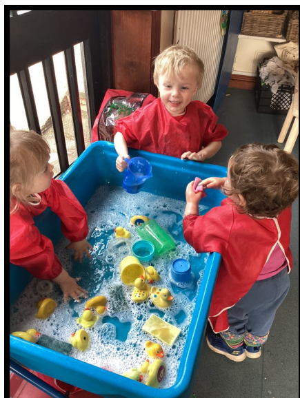
Water tray fun.