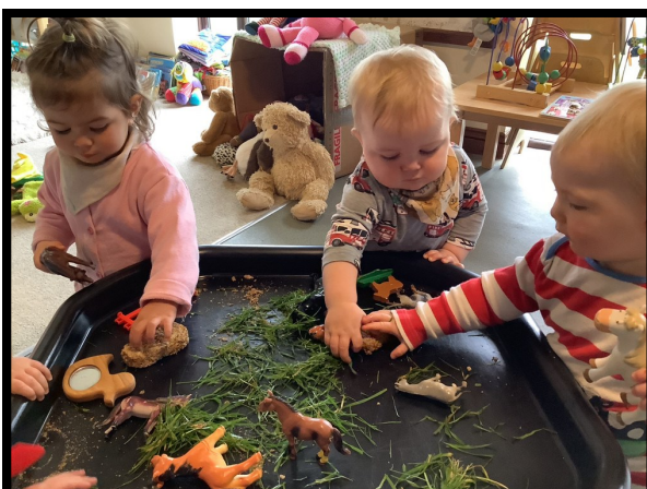
Exploring the farm sensory tray.