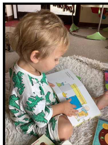
Enjoying a book