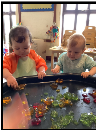
Jelly sensory tray fun.