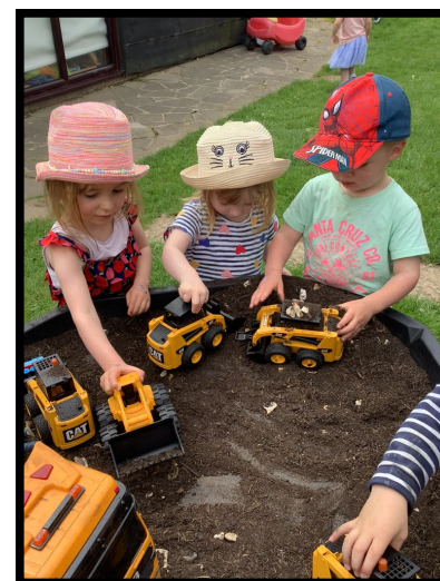
Diggers and soil sensory tray.