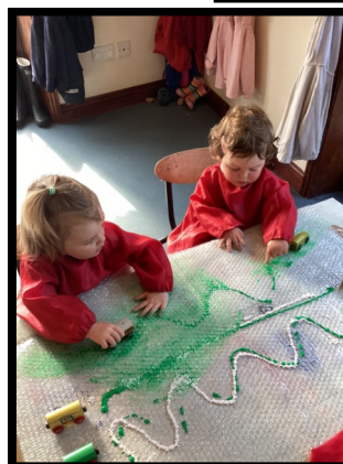
Exploring with marks and colour.