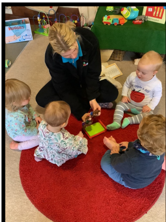
Enjoying one of the song sacks.