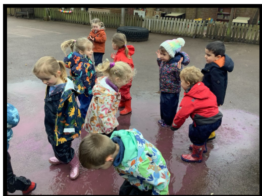
Creating colourful puddles.