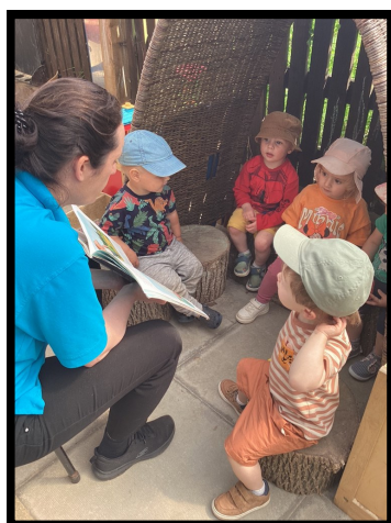
Enjoying a story outside together.