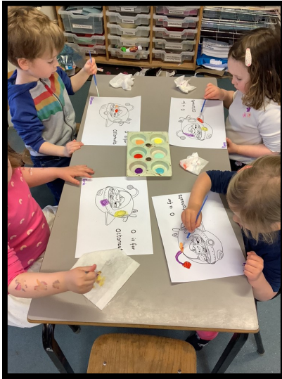
Creating our Octonaut pictures.