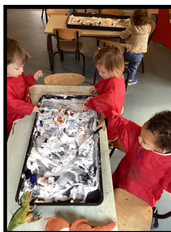
Using brushes to explore the foam sensory tray.