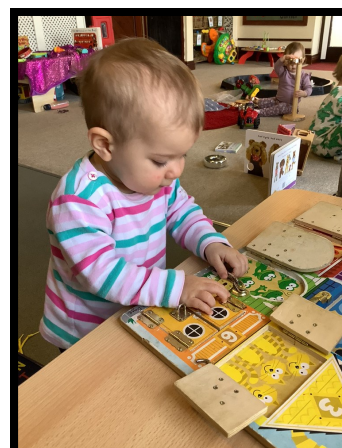
Showing good concentration whilst exploring the busy board.