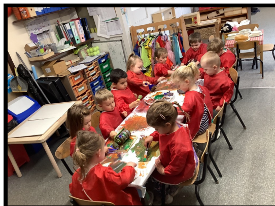
Mark making together.