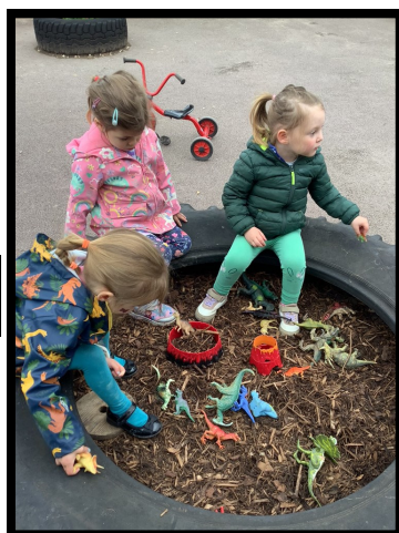
Having fun in the Dinosaur small world area.