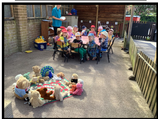
Enjoying a Picnic tea outside.