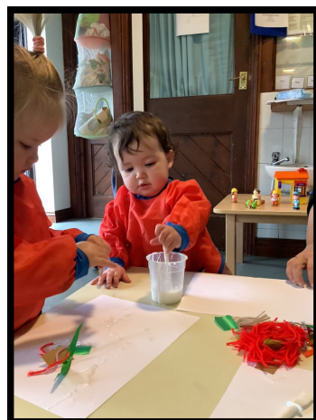
Lots of sticky glue to get creative with.