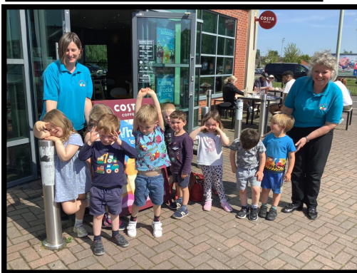
A trip to Costa.